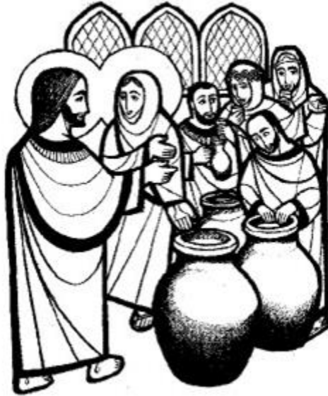
Water into Wine