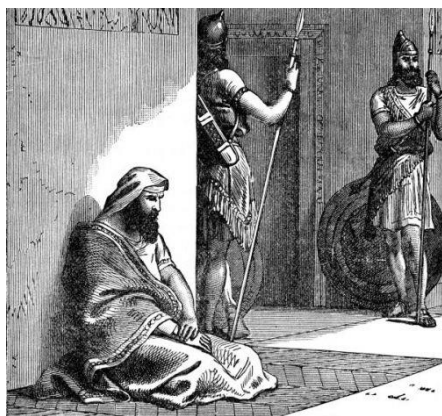
Mordecai sits in sackcloth and ashes at the gate.